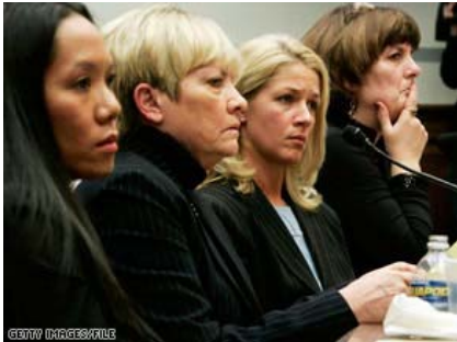
Family members of the slain Blackwater employees listen during a congressional hearing earlier this year.

WASHINGTON (CNN) -- Private military contractor Blackwater USA "delayed and impeded" a congressional probe into the 2004 killings of four of its employees in Falluja, Iraq, according to the House oversight committee said Thursday in a report.